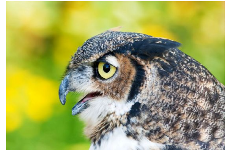
Note the 'ear tufts' on the great horned owl.