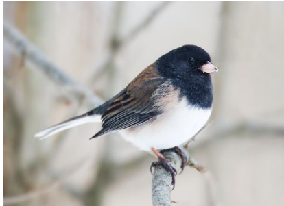
“Oregon Boy” a dark-eyed junco of the western Oregon subspecies.

According to the Cornell Lab of Ornithology, ‘there are two widespread forms of the Dark-eyed Junco: “slate-colored” junco of the eastern United States and most of Canada, which is smooth gray above; and “Oregon” junco, found across much of the western U.S., with a dark hood, warm brown back and rufous flanks’. So take a good look at the juncos at your feeder this winter—you may have your own “Oregon Boy.”