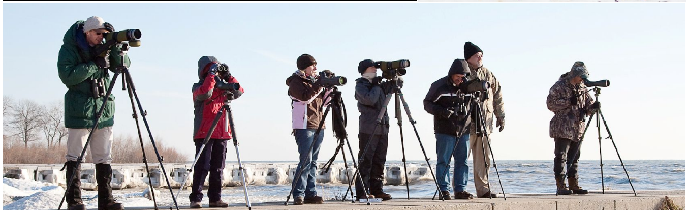
Hoy Audubon winter birding on the lake front (Shoop).