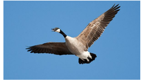
Canada Goose, Wind Point.

Hoy Honker In Living Color. Anyone who's lived through the days of black and white television can surely appreciate today's high-definition and colorful, digital technology! Gone are the days of just darker and lighter shades of gray.