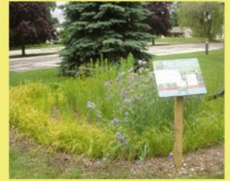
St. Andrew's Church Rain Garden in the Village of Caledonia

Individuals interested in installing a rain garden or viewing rain gardens built by others are encouraged to take a self-guided tour of any of our public demonstration rain gardens this summer. The rain gardens were built in 2008, 2009, 2010, 2011 and 2012 are listed on our website ( click here ) and are open to the public during normal business hours (8:00 am-5:00 pm). Most sites feature an interpretive sign. The demonstration sites are intended to educate people about rain gardens and their role in reducing polluted storm water runoff, and to inspire people to build a rain garden to help protect our watershed.