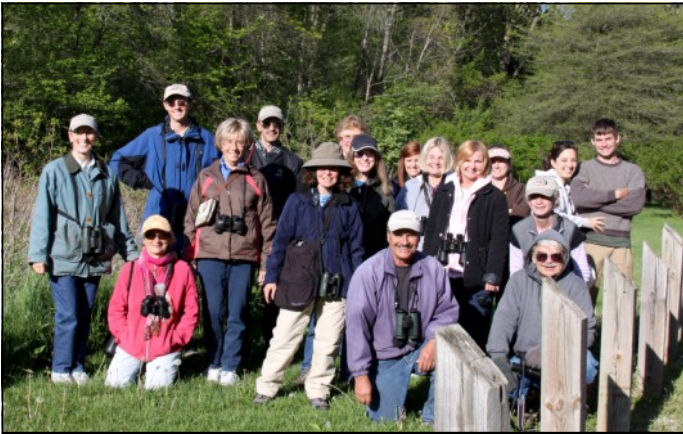
Hoy Members at Colonial Park