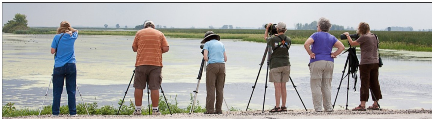
Birding at Horicon NWR in August, 2010.

HOY AUDUBON SOCIETY P.O. BOX 044626 RACINE, WI 53404 www.hoyaudubon.org