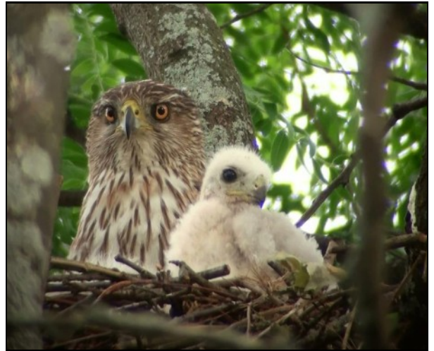
Cooper's Hawk www.hoyaudubon.org/birds/COHA