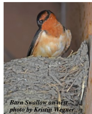
Barn Swallow on nest

If you are an advanced bird watcher, please consider signing up to volunteer as a principal “atlaser” for one of the 15 priority blocks in the Kenosha/Racine county area. (Principal atlasers should plan to spend at least 20 hours in the field during multiple visits in various habitat types for each 3x3 mile block surveyed.)