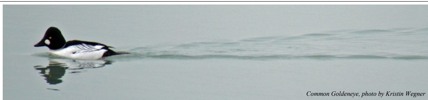
Common Goldeneye