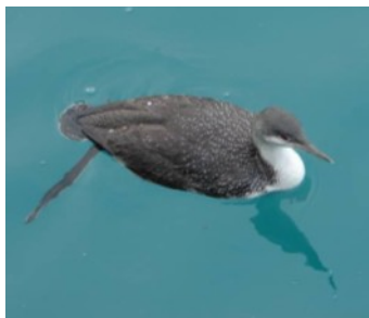
Red-throated Loon