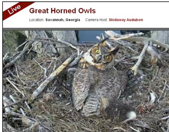
Screen capture taken from Cornell's Great Horned Owl cam

Thanks to the sponsorship of Cornell, local Audubon societies, and individuals, you can watch birds live online. If there isn't much action when you tune in, there are plenty of highlight clips available. Through these cameras, you can observe owls at rest and raptors delivering prey to the nest (though squeamish viewers may want to look away). Some cameras even have sound so you can hear mates communicate and flocks of passerines squabble at feeders.