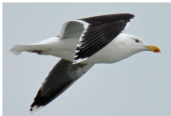
Great Black-backed Gull

Send to: Hoy Audubon Society, P.O. Box 044626, Racine, WI 53404